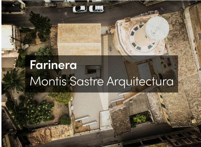
Farinera Montis Sastre Arquitectura