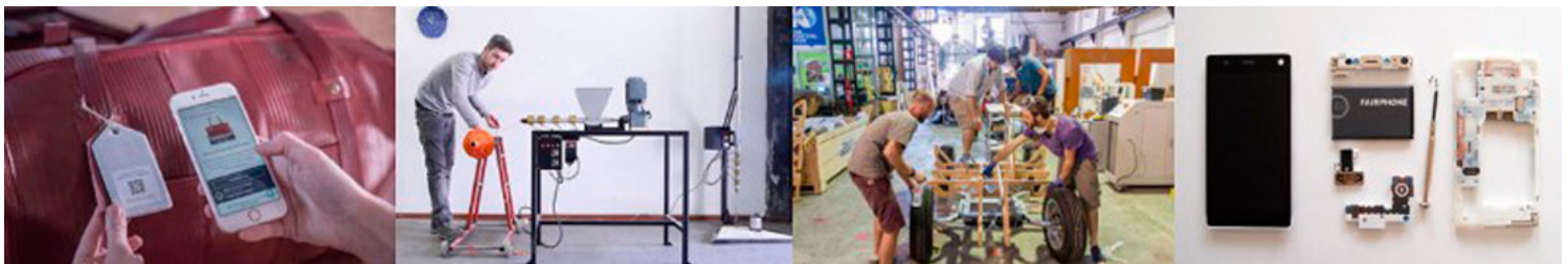
From left to right: Provenance project. Precious plastics open source machines to reclaim plastics and package in Fab Labs. Local production infrastructure. Fairphone is promoting transparency and circularity in the smartphone production.