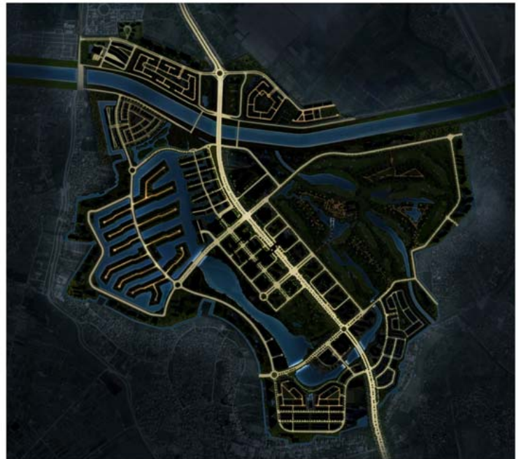
1:00 am to 7:00am