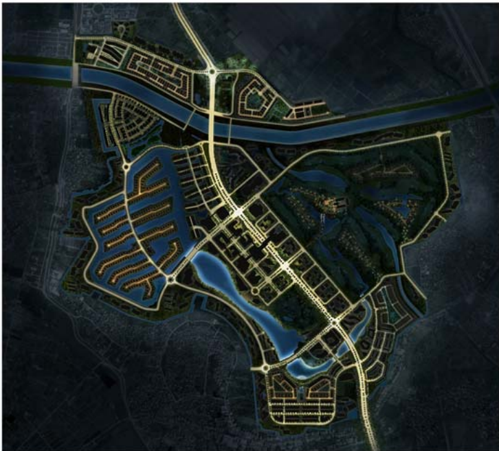
11:00 pm to 1:00 am