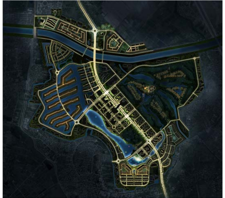
9:00 pm to 11:00 pm