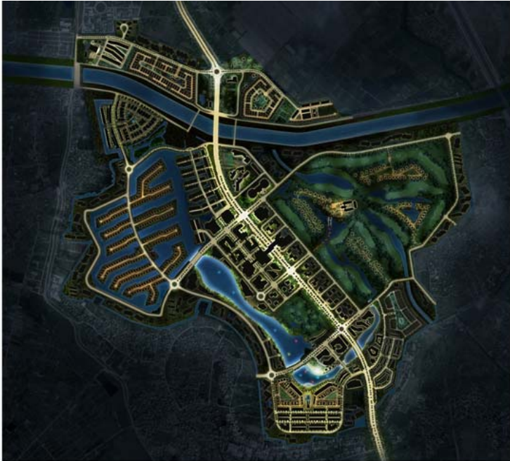
Sunset to 9:00 pm

https://urbannext.net/ecopark-lighting-masterplan/