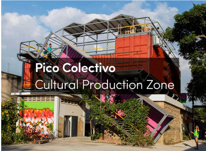
Pico Colectivo Cultural Production Zone