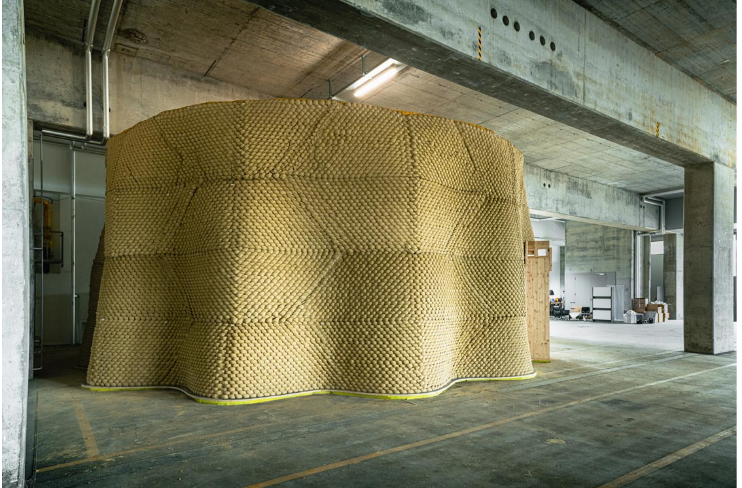
Clay Rotunda, SE MUSICLAB, Bern, 2020-2021