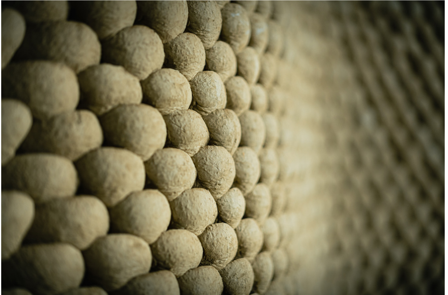
Clay Rotunda, detail view of the soft bond, 2020-2021