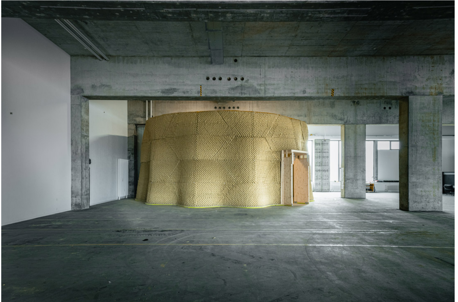
Clay Rotunda, SE MUSICLAB, Bern, 2020-2021