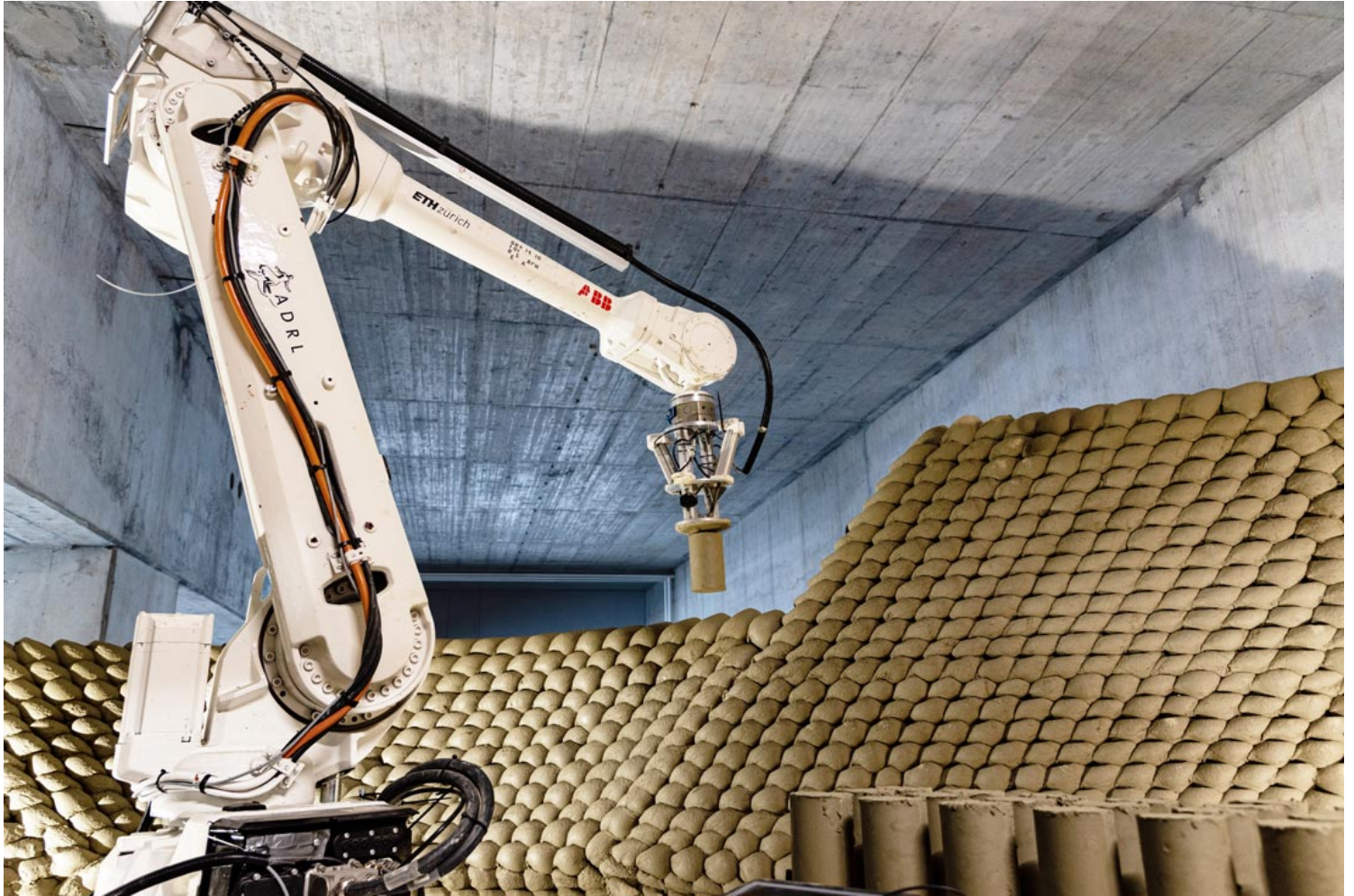
Clay Rotunda, fabrication setting with robotic arm, SE SEMUSICLAB, Bern 2020-2021