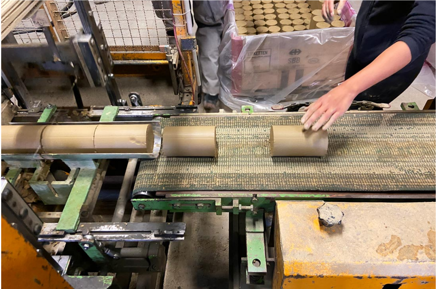
Clay Rotunda, fabrication of the soft-bricks at Brauchli Ziegelei AG, 2020-2021