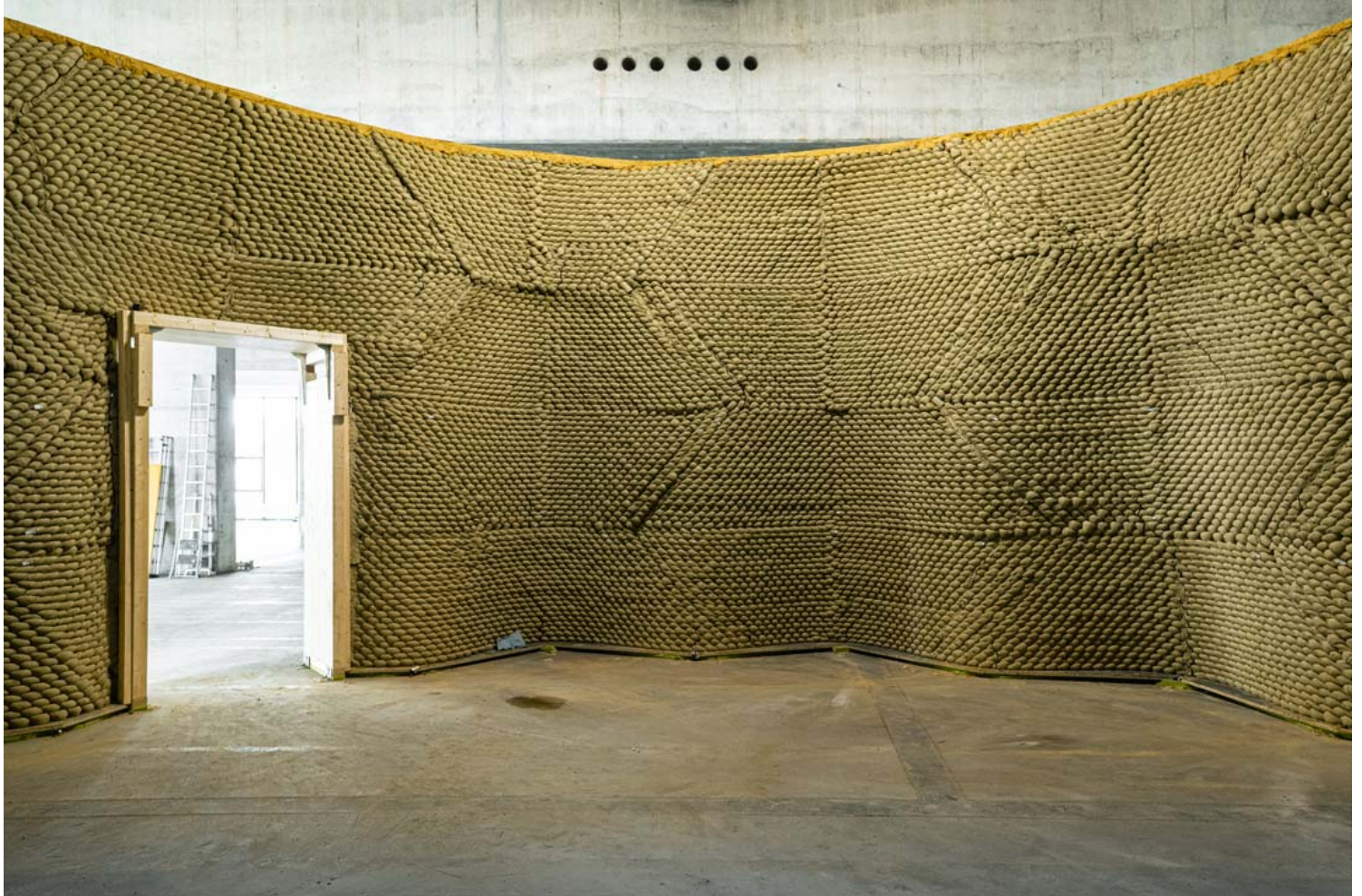
Clay Rotunda, inner view detail with door, SE MUSICLAB, Bern, 2020-2021