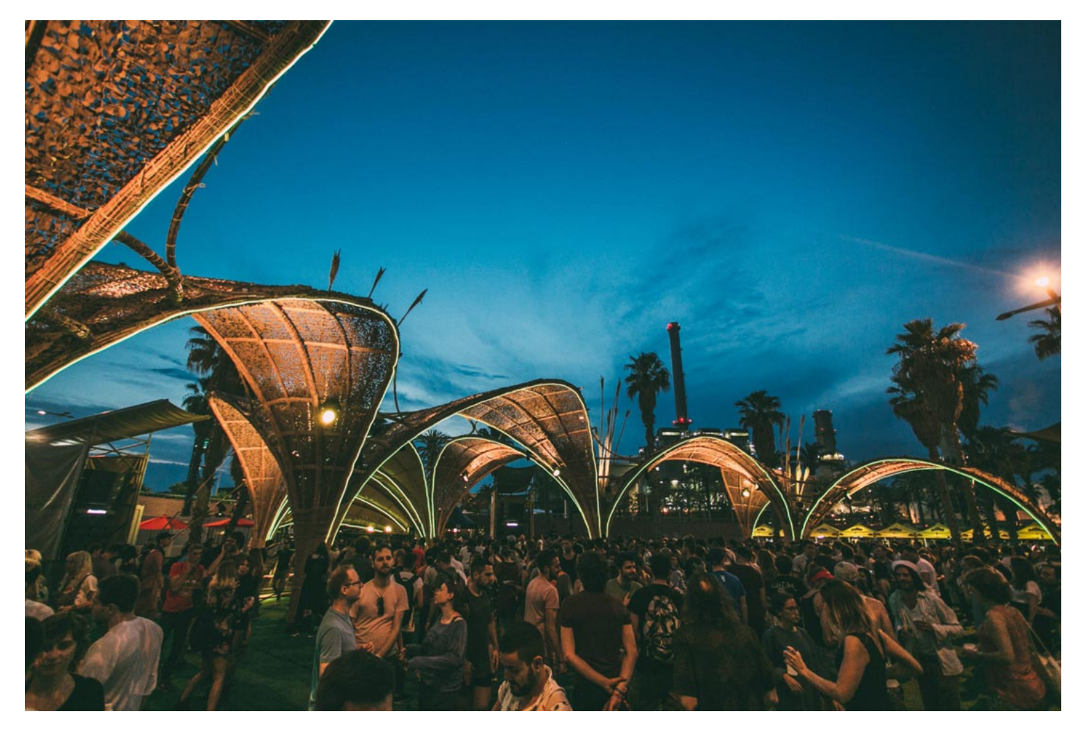
Tigrelab used ProtoPixel Create to produce organic animations, telling a story to the audience and eliciting their emotions. Five ProtoPixel Controllers were distributed across the structure, controlling over 200 meters of LED strips.