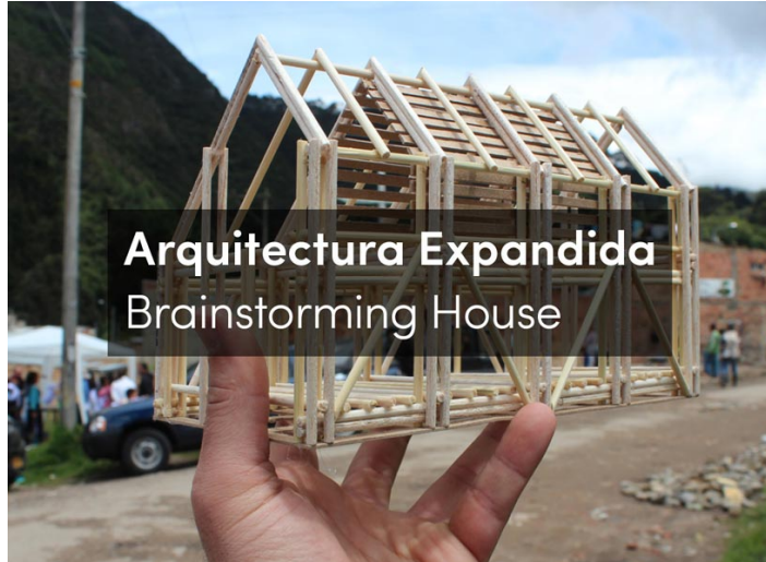
Arquitectura Expandida Brainstorming House