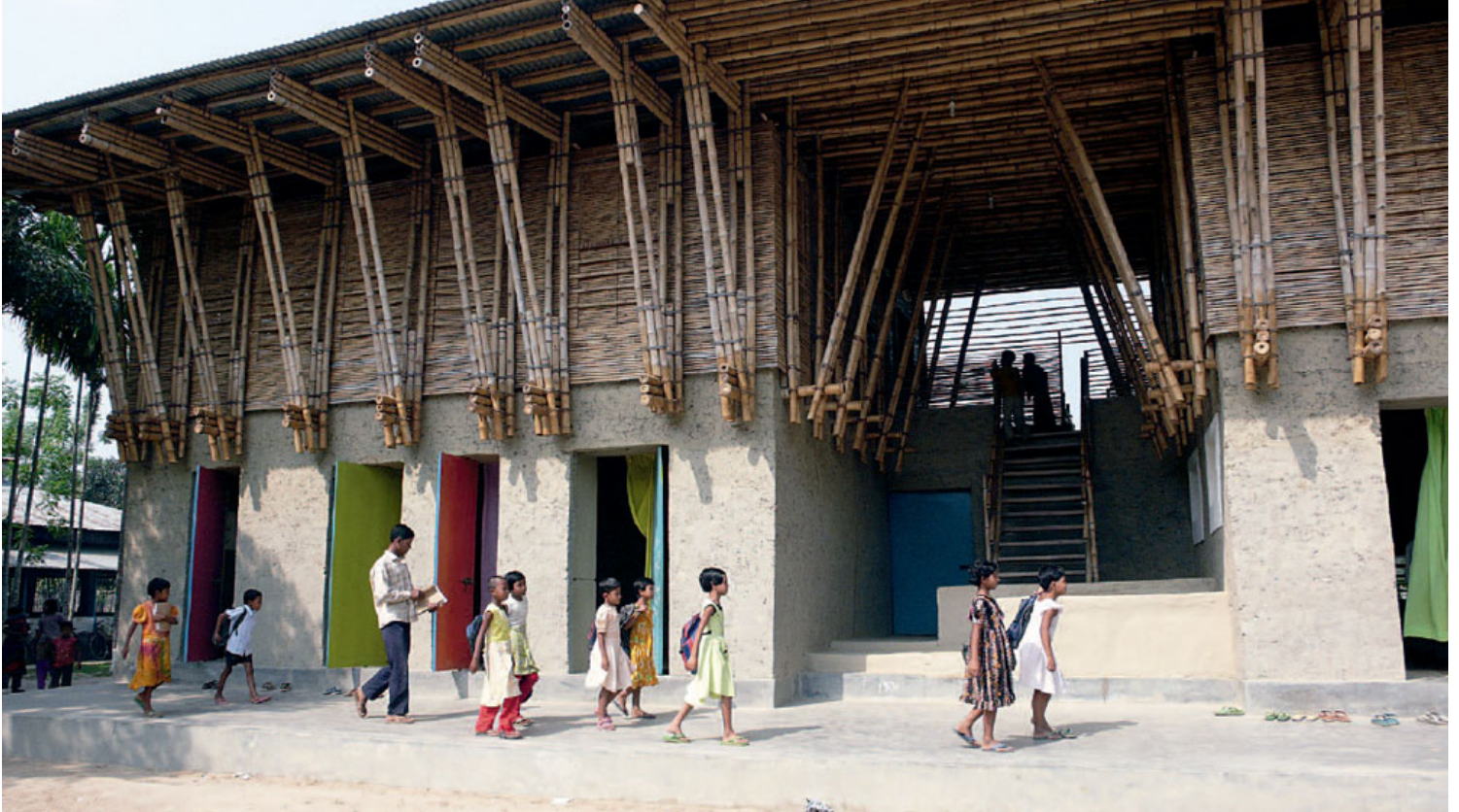
METI Handmade School, Anna Heringer + Eike Roswag

difficult and complex questions that address issues of Time, Labor, Urgency, Risk, and Empathy.