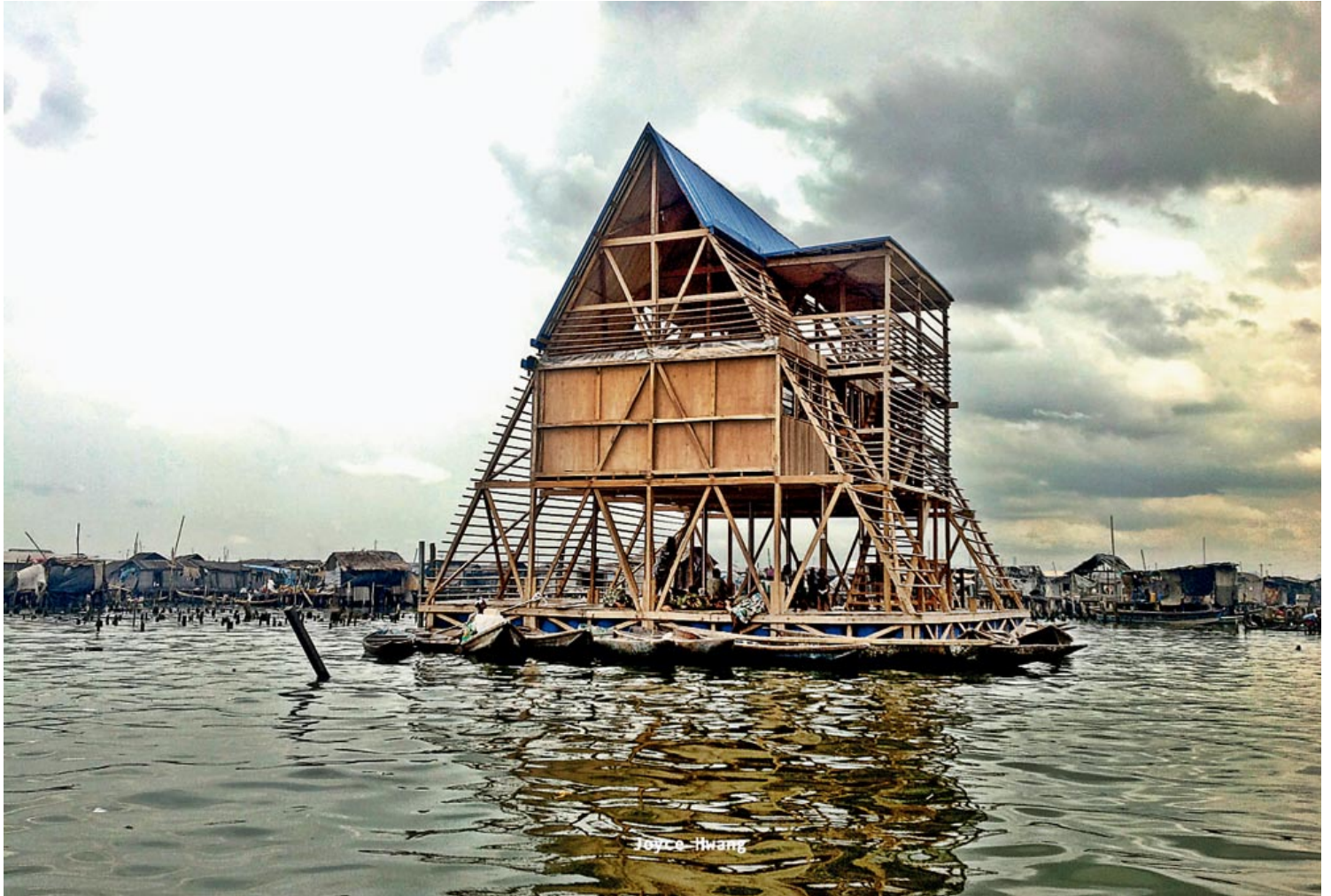
Makoko Floating School, NLÉ

between seemingly conflicting priorities, such as social justice and aesthetics, or problem-solving and problematizing? Looking beyond the short-term goals of volunteerism, architects and organizations are starting to develop long-term strategies to undertake socially-charged work. To consider the notion of architects as 'advocates,' we can begin by examining several fundamental frameworks for practice.