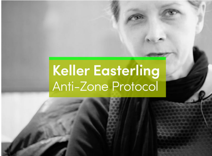
Keller Easterling Anti-Zone Protocol