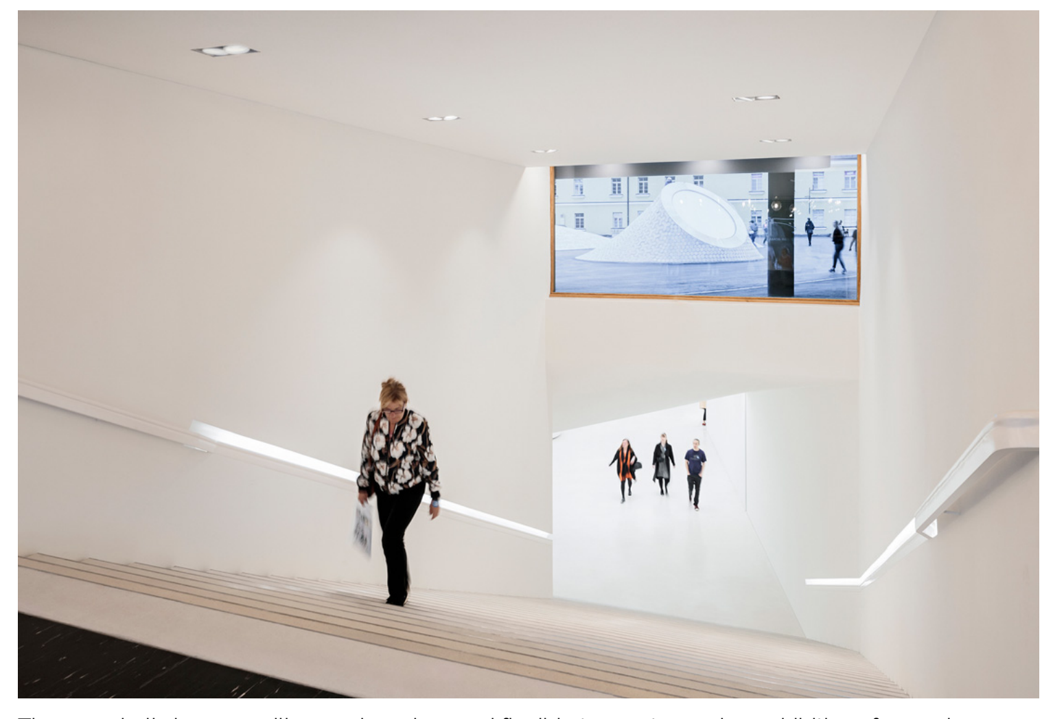
The open halls have no pillars and can be used flexibly to create varying exhibitions for modern demands. The figure of the old chimney defines the space.